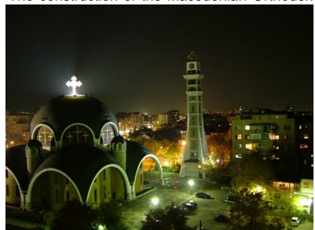
and his collaborators.